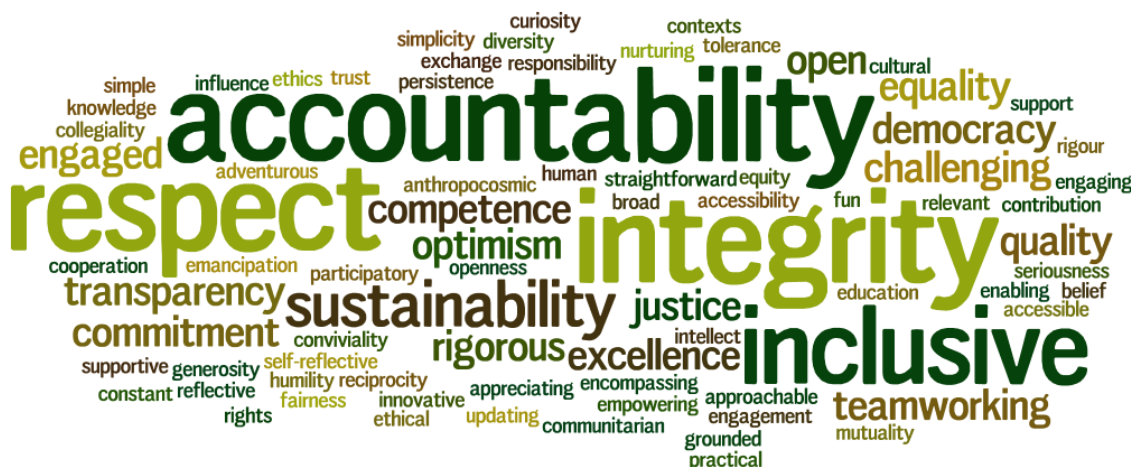
Figure 1: CSEAR values as defined at the 25th CSEAR Conference, St Andrews, September 2013

CSEAR aims to Creating a Sustainable World Through Accounting and Finance through Research, Engagement and Education in line with the Vision, Mission and Values agreed in September 2013 (see Figure 1). Throughout 2019 the Council continued to embrace the mission and values in all their CSEAR work. The Council has also reviewed all work undertaken against the VMV at each of the Council meetings.